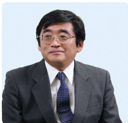
MASAMICHI KONO CHAIR IFRS FOUNDATION MONITORING BOARD

The Monitoring Board was formed in 2009 to help ensure public accountability of the IFRS Foundation by monitoring and reinforcing the public interest oversight function of the organisation, as well as to promote the continued development of IFRS Standards as a high-quality set of global accounting standards. In order to fulfill its responsibilities, the principal activities of the Monitoring Board are threefold: